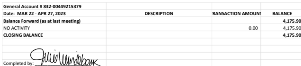
Treasurer's Report - Penhold Crossing Secondary School - Parent Society